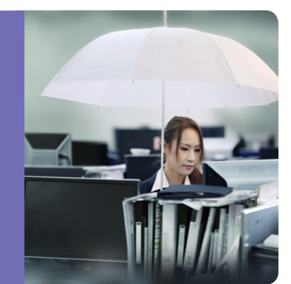
The Xerox eConcierge program manages your printer supplies automatically. It's the new default in office printing.

Plus, receive free lifetime service coverage* for all your eligible Xerox printers and multifunction printers with Xerox eConcierge.